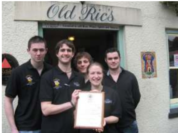
Bar staff at the Old Spot